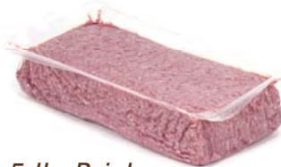
5 lb. Brick