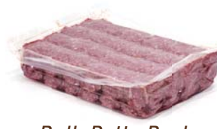
Bulk Patty Pack